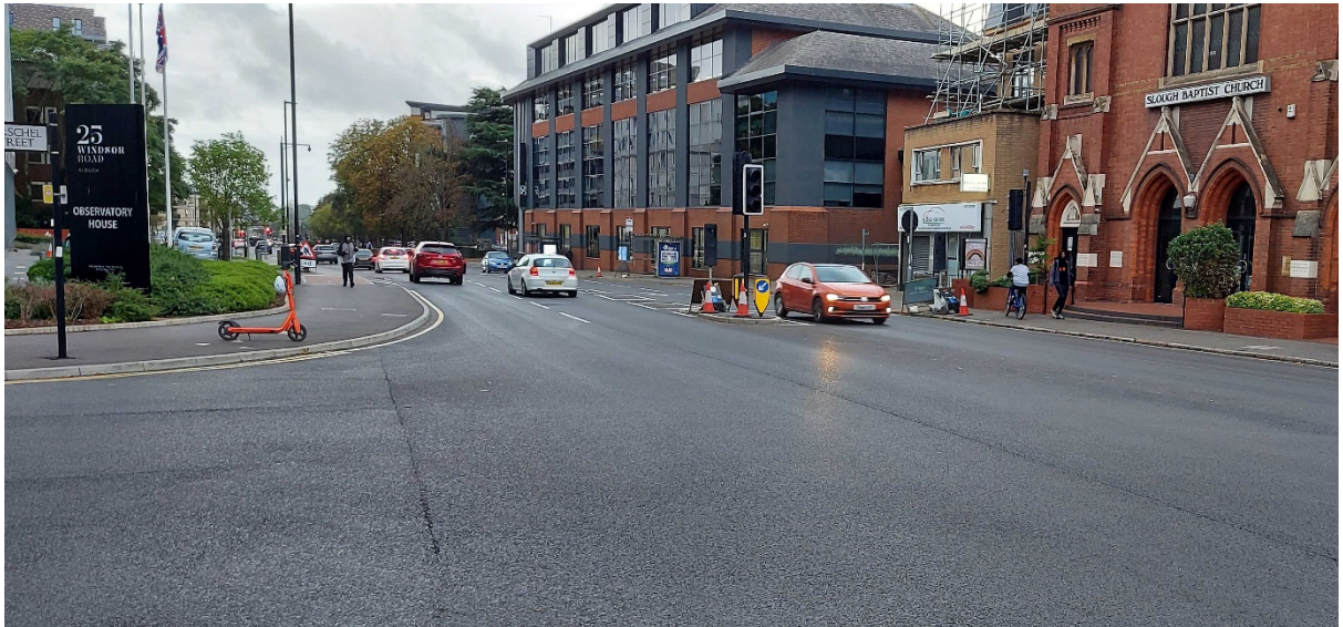
Image 3: Windsor Road looking south at the junction with Herschel Street. Taken September 2021