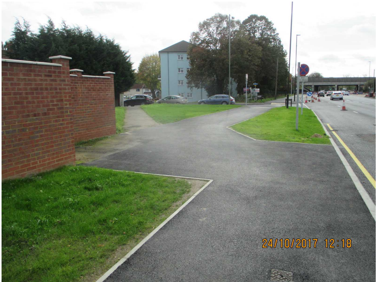
Image 4: Redesigned footway adjacent to Windsor Road at the junction with Vale Grove, looking south towards the borough boundary. Taken mid-scheme 2017