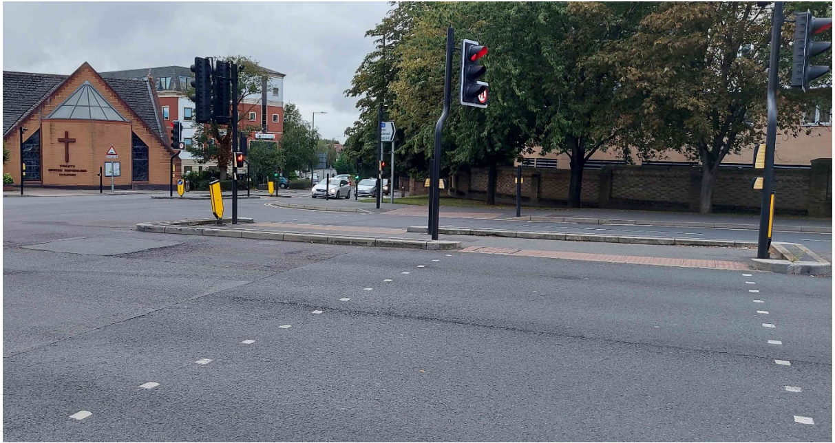
Image 2: Crossing to the north of the junction of Windsor Road and the A412. New crossing facility and signals enhancement. Taken September 2021